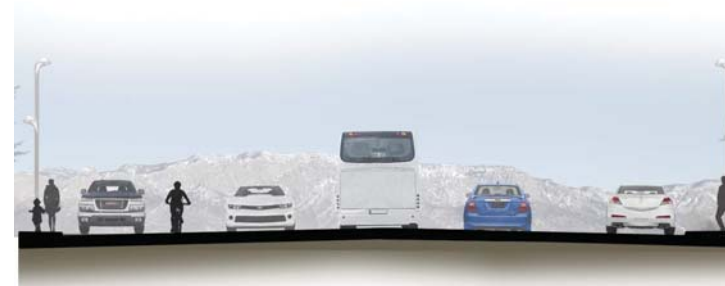
CROSS SECTION BETWEEN 11TH AND 12TH STREET